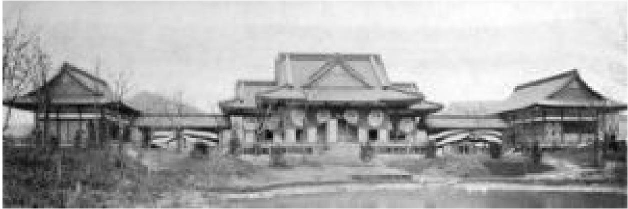
Ho-o-den (Phoenix Hall) erected by the Japanese government for the 1893 Columbian Exposition in Chicago

There he visited the Japanese pavilion a recreation of the Ho-o-den, an 11th century Buddhist temple near Kyoto, within which were created different kinds of traditional Japanese interiors.